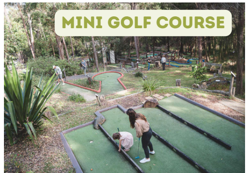
MINI GOLF COURSE