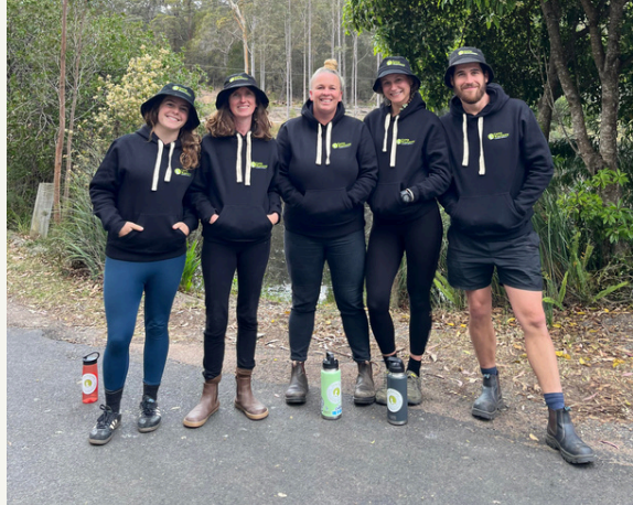
Camp Kianinny Team