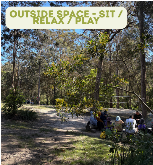
OUTSIDE SPACE - SIT / RELAX / PLAY